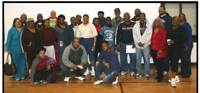
Progressive Union Mission Day Volunteers