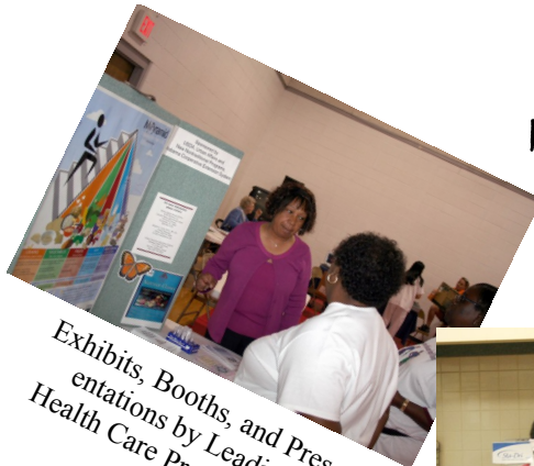
Exhibits, Booths, and Presentations by Leading Health Care Professionals