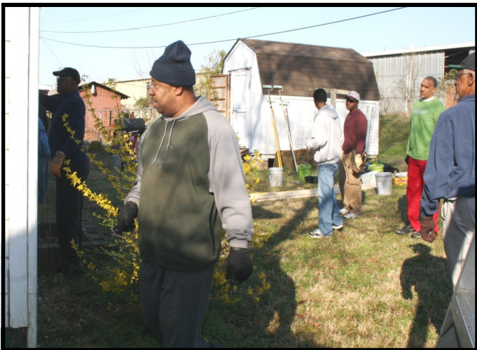
Progressive Union volunteers working on a house on Moore Avenue