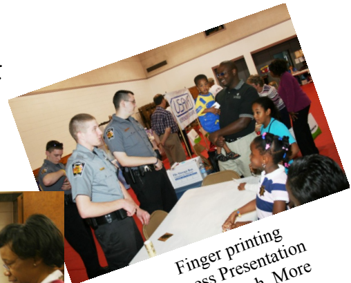
Finger printing Fitness Presentation Much, Much, More