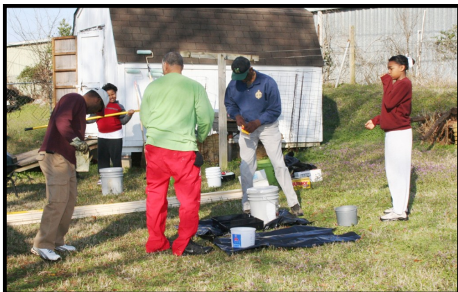
Progressive Union volunteers working on a house on Moore Avenue