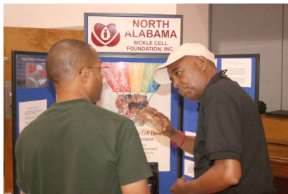
Informative Displays Seminars Fun Door Prizes