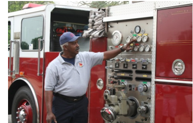
Face Painting Fire Truck Display Refreshments Crafts for the Children