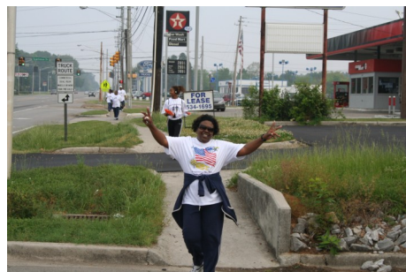
Fitness Walk May 7, 2011 6:00 a.m. Progressive Church to the Wynn Drive Post Office