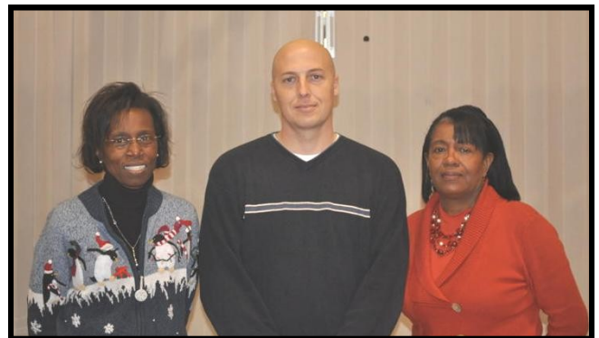
Principal and Coordinators for the trip