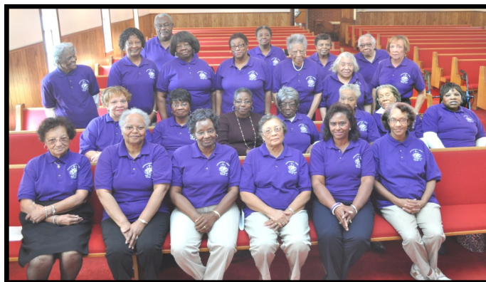
The Titus II Group